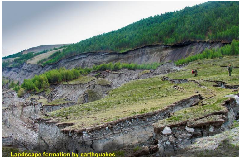
Landscape formation by earthquakes

The visited sites include both typical and unique for Siberia objects such as the biggest oligotrophic peat bog in the world, different variants of taiga jungles, forest-steppe and steppe biomes, intact hotspots of biodiversity with more than 120 higher plants species per 100 m 2 , giant herbal vegetation on apparently poor soils, the imposing dynamics of huge Siberian rivers, signs of Pleistocene and modern glaciers and many other famous features of the remote Altai mountains (UNESCO world heritage) nearby the Chinese and Mongolian borders.